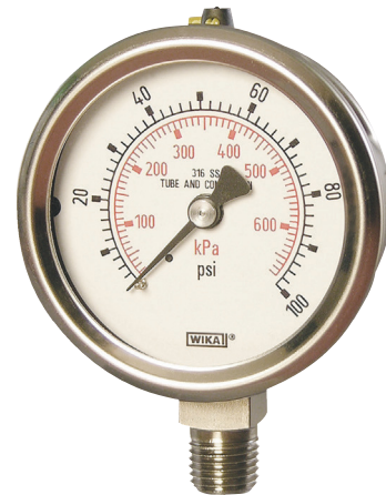
Bourdon Tube Pressure Gauge Model 232.53 - 2½"

Ambient: -40°F to +140°F (-40°C to +60°C) - dry -4°F to +140°F (-20°C to +60°C) - glycerine filled -40°F to +140°F (-40°C to +60°C) - silicone filled Medium: +212°F (+100°C) maximum